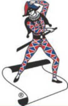
TABLE RONDE Pour une médecine de la danse. Les programmes autour de la santé du danseur: approches internationales

Forum International Danse et Santé (FIDS) #1 du CND - 27 et 28 Novembre 2014